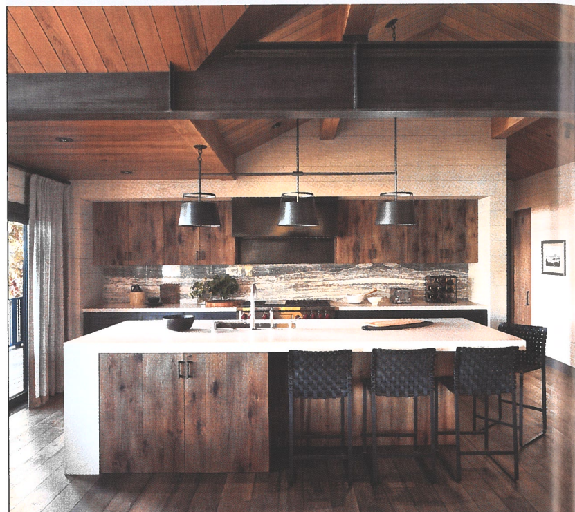
A travertine slab used for the kitchen backsplash features veining intended to echo the ridgelines of the surrounding mountains

The right music elevates the mood and enhances the event experience!