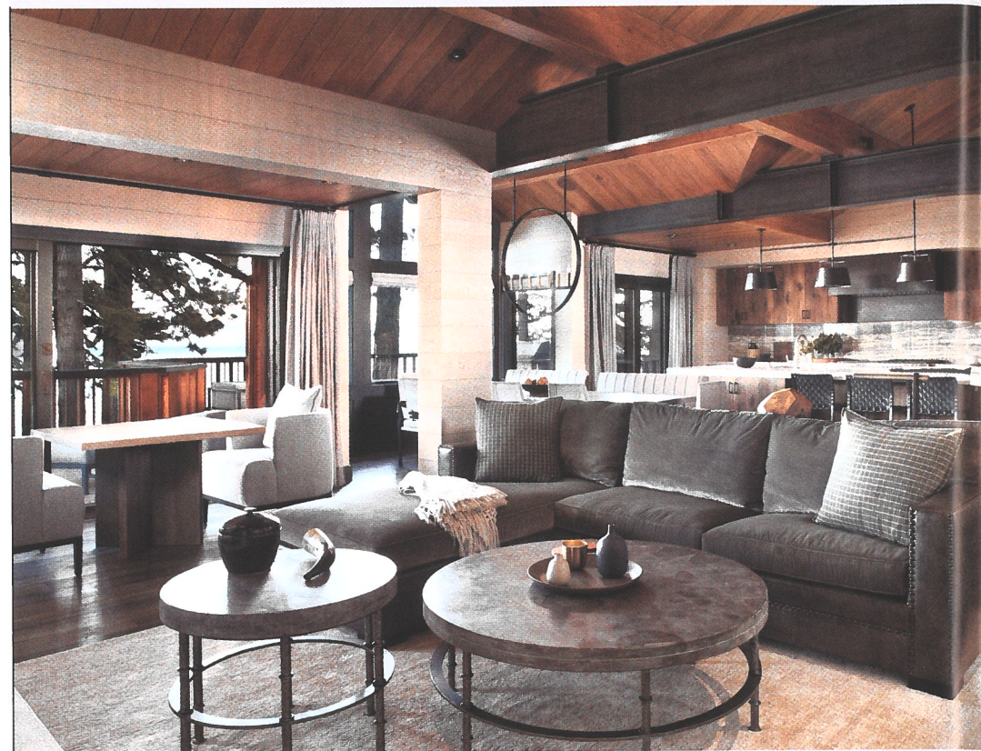
The living area opens through a large glass door to an expansive deck overlooking the lake

ma c.970.846.0321 p.530.553.1439 marsden architects.com